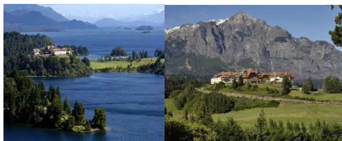
Península Llao Llao