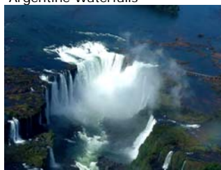
Garganta del Diablo